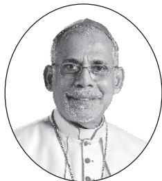
Arch bishop Patriarch Filip Neri Cardinal Ferrao